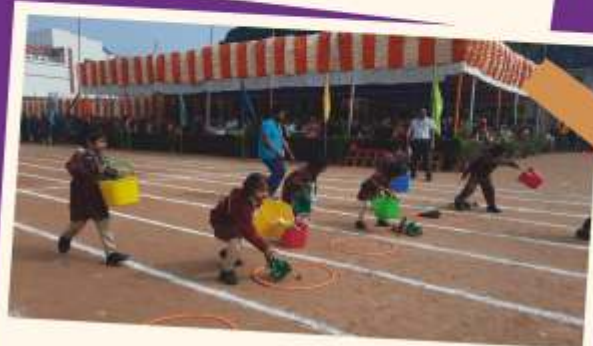
Annual Sports Day