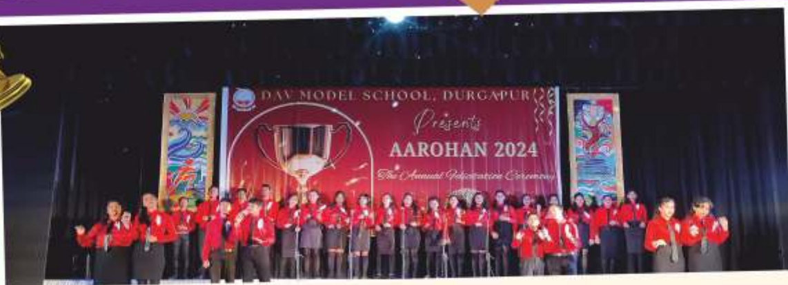
ANNUAL FELICITATION CEREMONY 2024